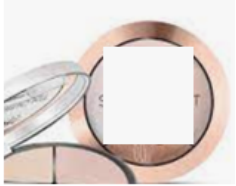
Watermarks or text