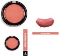
Multi views in MAIN