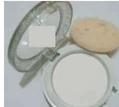
Blurry or pixilated images