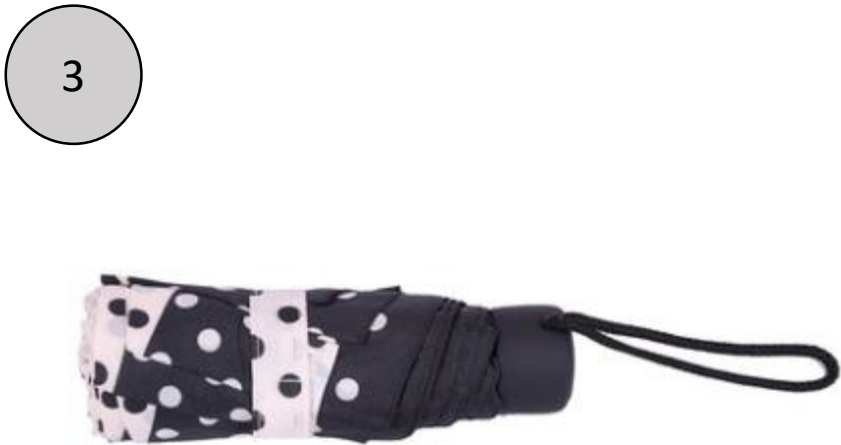
Closed View of Umbrella