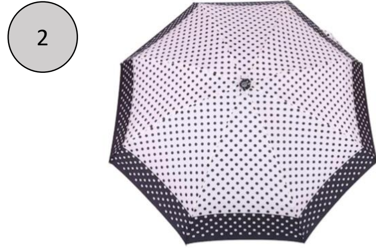
Top View of Umbrella